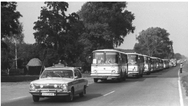
4

After being told they would be able to return to their homes within due time, Pripyat residents were given only two hours' notice to gather their belongings and evacuate the city. Residents were advised to pack two to three days' worth of food and clothing as well as any important belongings. There were also reports of many residents attempting to bring radiation meters, known as dosimeters, but these devices were confiscated by the authorities.